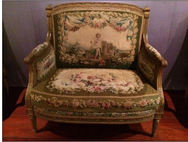
Pic. 10: A berger from Gulbekian Collection.

According to written sources; in the 14th century France, with the migration of the Fleming workers, tapestry weaving has started in Aubusson town and become popular after spreading to other regions. Georges Jacob is the designer of the armchair and created it in the years 1780-89, at Paris and it is classified as Beauvais tapestry (Picture 10).