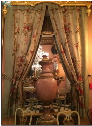
Pic. 18: Usage of rose design a tapestry curtain.

Rose pattern is used within a different function on a 19th century tapestry curtain located in Madrid Cerralbo Museum (Picture 18).