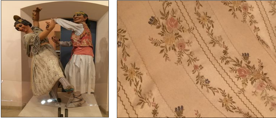
Pic. 16 a-b: Fallas models and usage of rose design on the fabric.

Flower pattern cloth on a skirt of Fallas woman model of 1935, in Spain's Valencia Fallas Museum (Picture 16 a-b).