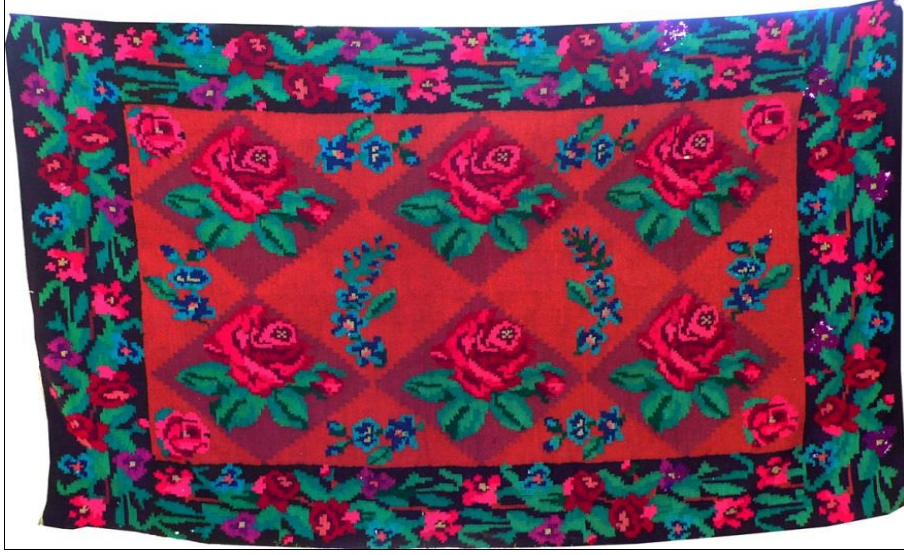
Pic. 2: Sample no: 2.