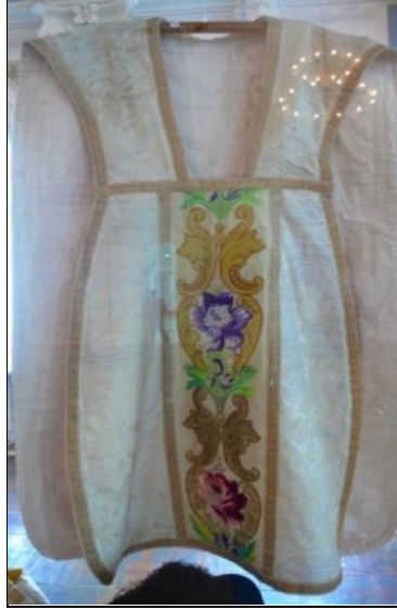
Pic. 15. Rose design at cloth.

Flower pattern cloth on a skirt of Fallas woman model of 1935, in Spain's Valencia Fallas Museum (Picture 16 a-b).