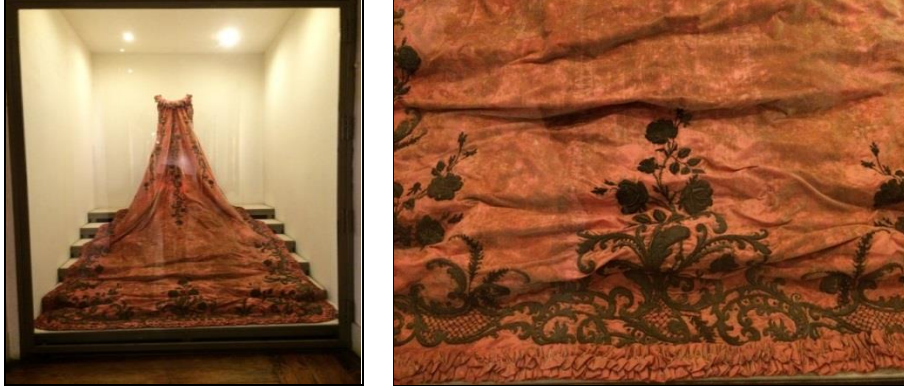
Pic. 17 a-b: Usage of rose design at cloak.

Rose pattern is used within a different function on a 19th century tapestry curtain located in Madrid Cerralbo Museum (Picture 18).