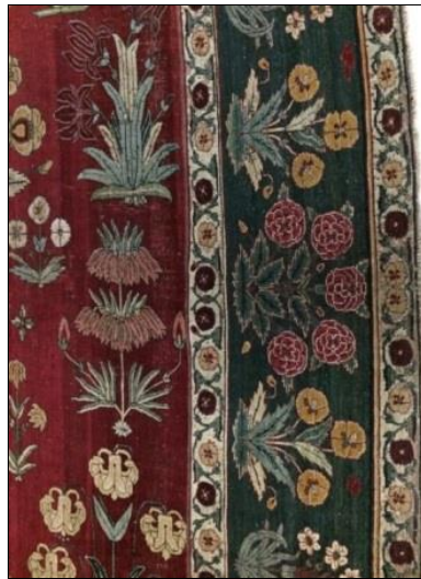
Pic. 14: Bunch of rose at border design.