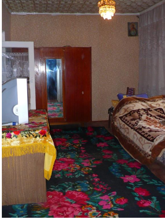
Pic. 3: Usage of the ground of Sample 3.