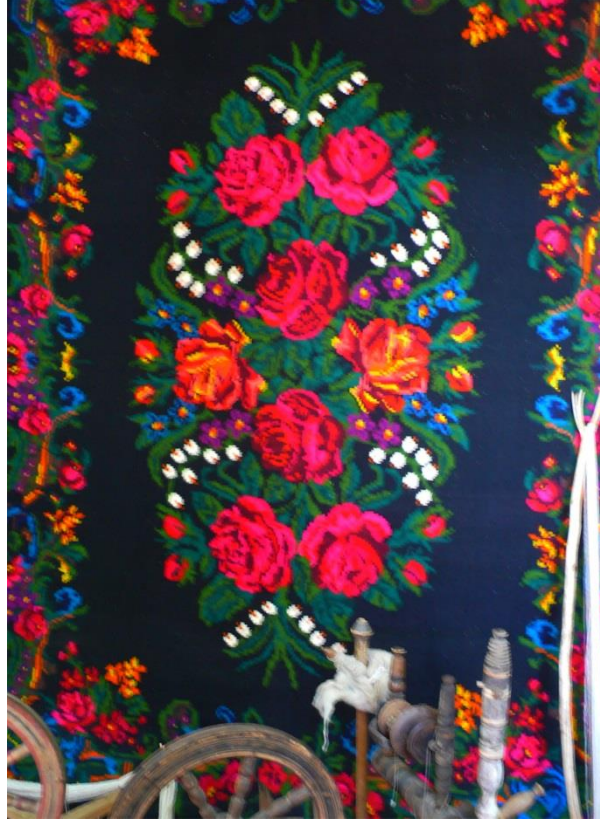
Pic. 5: Detail of sample no:5 at Museum of Ceadir-Lunga.

Place: Museum of Ceadir-Lunga, Ceadir-Lunga