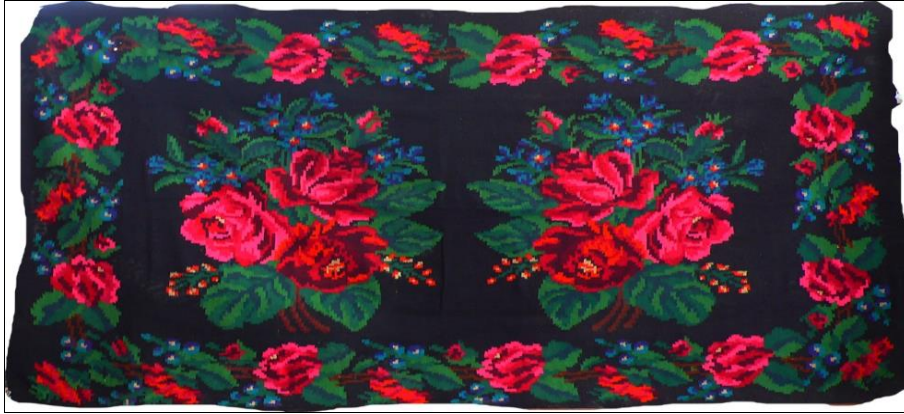
Pic. 1: “Sabunlu Kilim”