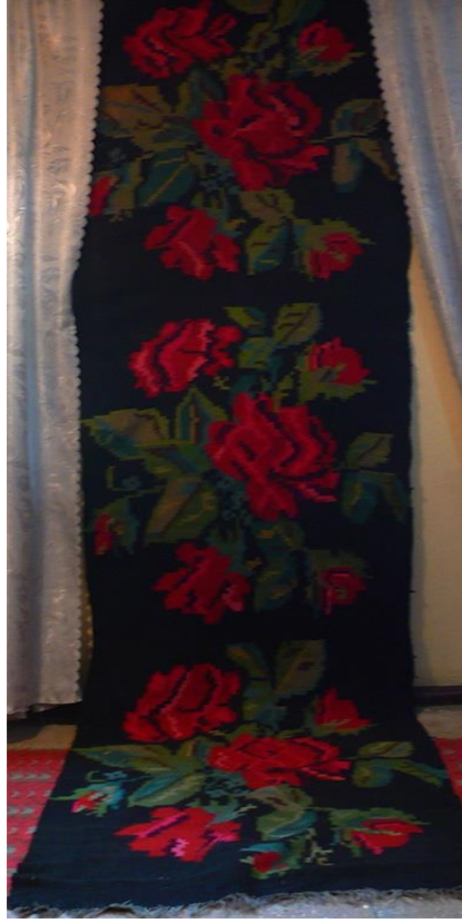
Pic. 4: Sample no: 4.