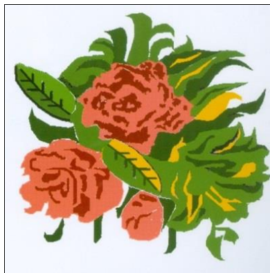
Pic. 12: Rose motif at Kafkas rugs (Stone, 2004, p. 142).

Azerbaijan Karabagh has been an area of settlement since the ancient era, due to its geographic advantages and became the country of Turkish communities over a thousand years. “Karabagh rugs reflect unique features in regards of color, composition and technique. New compositions were created with the classical of 18th centuries Shusha patterns, magazines from various places of Central Asia, scarves and various wares. Roses in the garden, roses in pots, cloud, etc. patterns were woven” (Parlak & Ergüder, 2010, p. 96). “The 19 th century Russian court adopted French tastes and fashions, including furnishings. Commissions for rugs in the French style were given to Karabagh weavers. Russian officers involved in the pacification of the Caucasus may also have ordered rugs in rough imitation of Aubussons, Gobelins and Savonneries. So, the cabbage rose came to the Caucasus” (Picture 12) (Stone, 2004, p. 142).