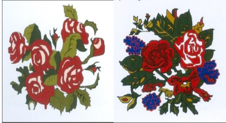
Pic. 11 a-b: Rose motifs at Kirman and Afgan carpets (Stone, 2004, p. 16)

Azerbaijan Karabagh has been an area of settlement since the ancient era, due to its geographic advantages and became the country of Turkish communities over a thousand years. “Karabagh rugs reflect unique features in regards of color, composition and technique. New compositions were created with the classical of 18th centuries Shusha patterns, magazines from various places of Central Asia, scarves and various wares. Roses in the garden, roses in pots, cloud, etc. patterns were woven” (Parlak & Ergüder, 2010, p. 96). “The 19 th century Russian court adopted French tastes and fashions, including furnishings. Commissions for rugs in the French style were given to Karabagh weavers. Russian officers involved in the pacification of the Caucasus may also have ordered rugs in rough imitation of Aubussons, Gobelins and Savonneries. So, the cabbage rose came to the Caucasus” (Picture 12) (Stone, 2004, p. 142).