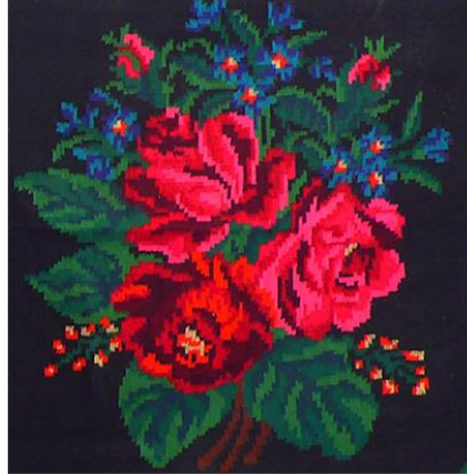
Pic. 6: Bunch of roses that named "Sabunlu".

In the beginning, the basic geometrical forms and followingly, the derivatives and repentance of the forms are described in the Turkish Language Institution's Grand Dictionary as "Each one item, coming side by side and forming the ornament work and as solitary forming a unit" ( http://www.tdk.gov.tr ). Throughout the centuries, different meanings are attributed to the patterns, but the visual features have been preserved till today. In this aspect; when making a visual comparison in different cultures, of the rose bundle pattern (Picture 6) named as "sabunlu (soapy) by the Gagauz Turks; following data can be reached: