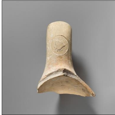
Pic. 7: Rose emblem on amphora. ( http://www.metmuseum.org , 05.03.2014)

In the background pattern of the silk fabric which was thought to be woven in 780- 900 years in Syria (?), the struggle between man and lion can be seen. (Picture 8). In the top and bottom narrow borders, the rose and its bud is woven ( http://collections.vam.ac.uk ).